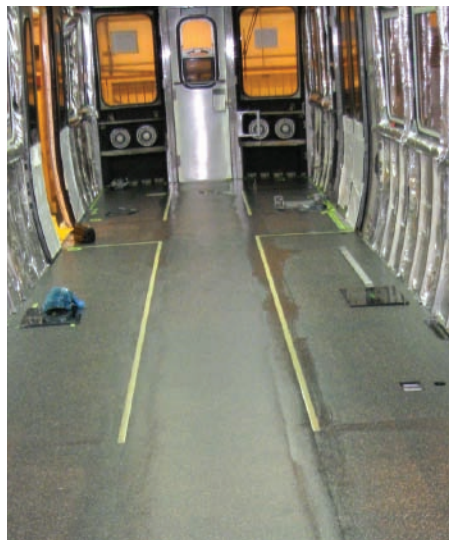
Photoluminescent strips placed in the flooring will aid in way-finding during an evacuation when car lighting is not available.

CTA conducted trials with cars incorporating aisle-facing seats to maximize the number of standing passengers a rapid transit car can accommodate to assess customer acceptance. The AC cars will apply the lessons-learned from these trials and will have all aisle-facing seats (sometimes called "bowling alley seating").