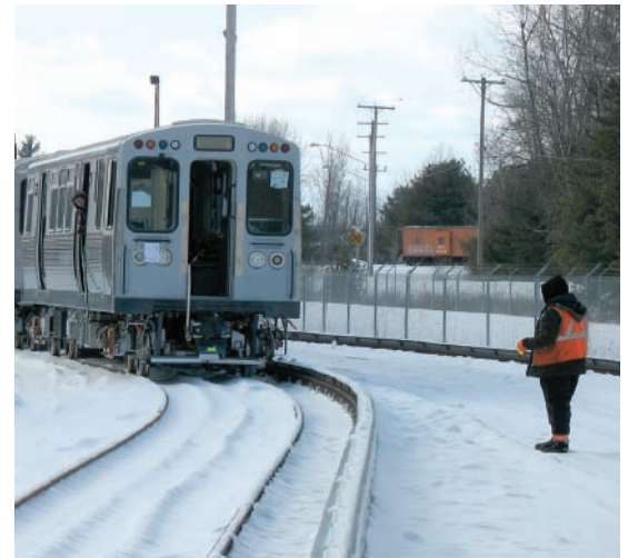
Car assembly and testing take place in two separate facilities in Plattsburgh, NY. A Canadian Pacific locomotive pushes the first two prototype cars into the Bombardier test facility on January 27, 2009.

It's been over a decade since the Chicago Transit Authority (CTA) received an order of new rail cars.