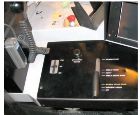
A cab view shows the controller the train operator uses to control acceleration and braking of the train, as well as the "Train Operator Touch Screen" (or TOTS) to the upper right of the view, which the operator will use to monitor train operation and for trouble-shooting.

On board the new cars, inverter packages will convert the DC to variable voltage, variable frequency AC, which is then supplied to the traction motors to propel the cars.