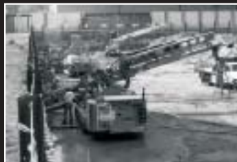
Earth Retention at DOE Fermilab and Prentice Women's Hospital.